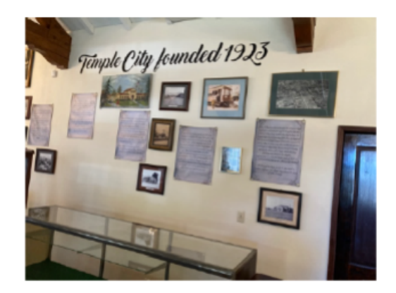
A highlight of our renovated museum is the timeline/collage wall. The cases on front of the wall will include items dating from our city's founding.