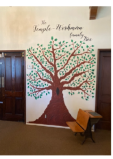
Our family tree will be one of our interactive displays featuring information about members of the Temple and Workman families.