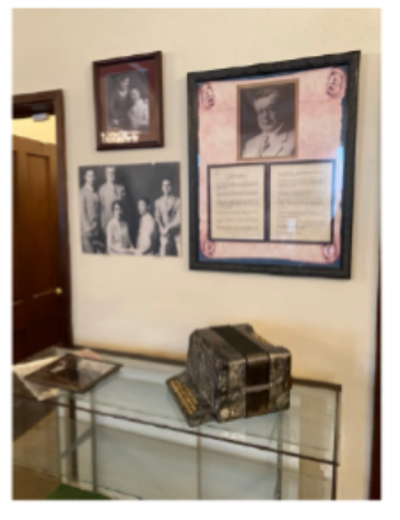
We're featuring reminders of some of our early Temple City businesses

ためでは、日本語のなどのでは、日本語のなどのなどのなどのなどのなどのなどのなどのなどのなどのなどのです。