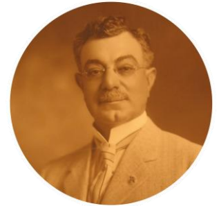
Walter P. Temple